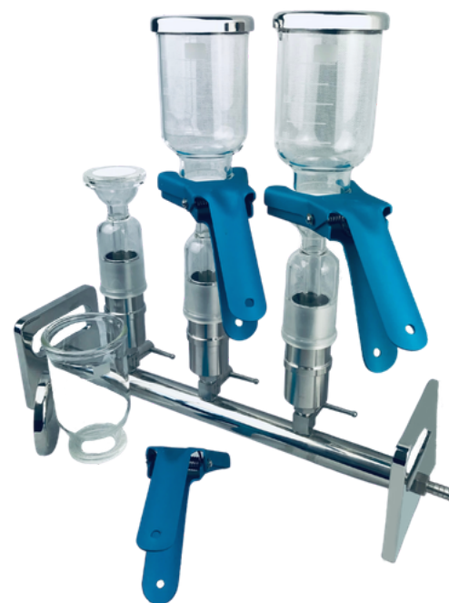
SPE Disk manifold for AttractSPE® Disks

Note: The eluate can also be evaporated to concentrate the analytes and improve the limit of quantification.